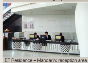
EF Residence – Mandarin: reception area