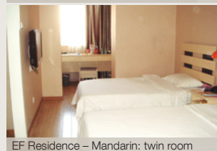
EF Residence – Mandarin: twin room